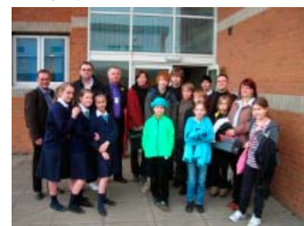
Visitors from Finland: Visitors from Finland 3

We are co-ordinating a two year, fifty thousand Euro project focused on RoboDance with other schools in Europe and Calday Grange Grammar on the Wirral. This year, forty five Childwall pupils have been involved in different Robotic activities and eight of them have been selected to become ambassadors for the school in the European competition. As part of the project we were visited last month by our partner schools from Hungary and Finland.