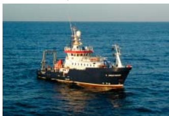
Research Vessel Prince Madog: Livbay5

Thirty Five of our year 10 pupils will carry out a major piece of scientific research between April and June. They will have the opportunity to look at a real world problem with Scientists from the Proudman Oceanographic Laboratory, using their fantastic Liverpool Coastal Observatory facility. Pupils will be visiting a research vessel, The Prince Madog, later this month.