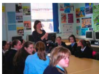
6th March 2008

The well known Poet, Eleanor Rees, visited Childwall Sports College during World Book Day: