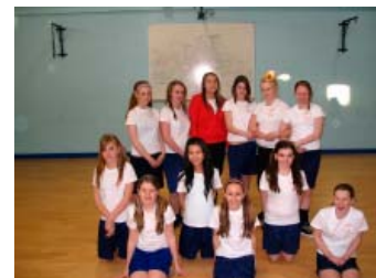
RoboDance Team: RoboDance Training 008